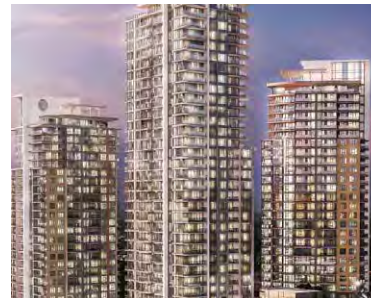
KINGS CROSSING By Cressey Development 3-tower mixed-use project