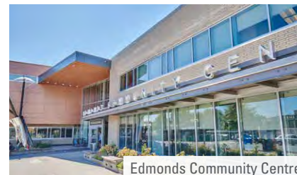
Edmonds Community Centre