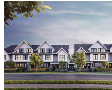
ARCOLA by Kingswood Real Estate 22-unit townhouse project