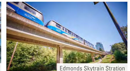
Edmonds Skytrain Station

This communication is not intended to cause or induce breach of an existing listing agreement. The information contained herein has been obtained from sources deemed reliable. While we have no reason to doubt its accuracy, we do not guarantee it. It is your responsibility to confirm its accuracy and completeness independently.