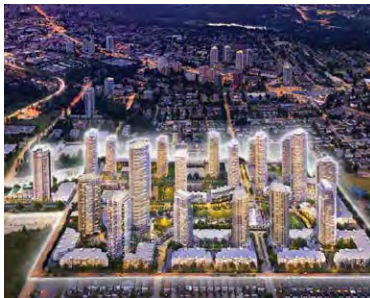
SOUTHGATE CITY by Ledingham McAllister Master planned community