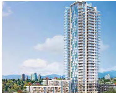
PRECEDENCE by Ledingham McAllister 351-suite high-rise