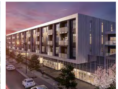
PIXEL by Thind Properties 101-suite lowrise condo